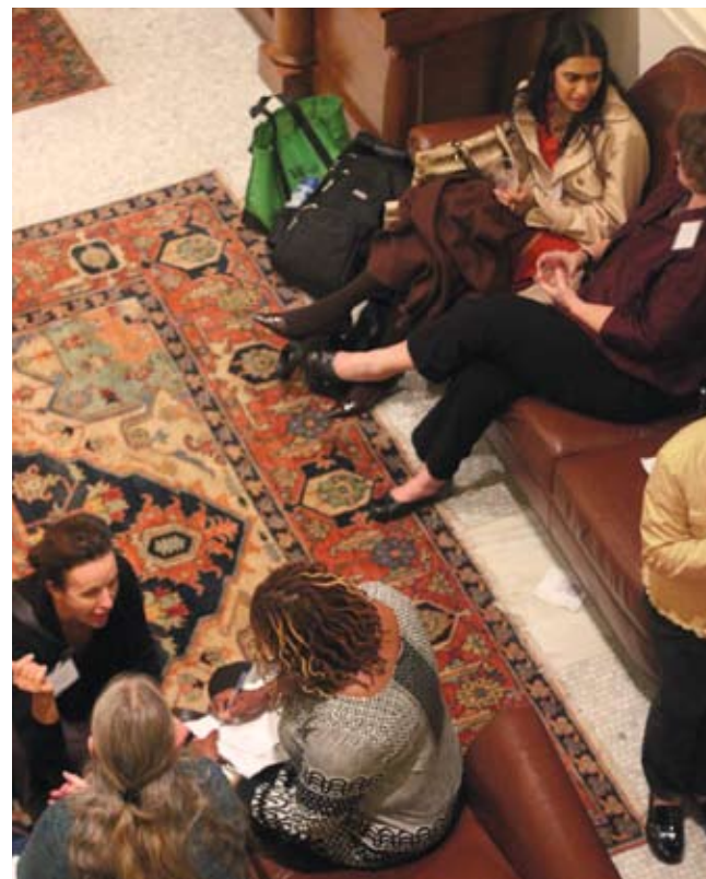
Above: ACMHE members gather in the lobby of Amherst College's Converse Hall at the start of the 2012 ACMHE Conference. Below: Sharing research at the conference's Poster Session.