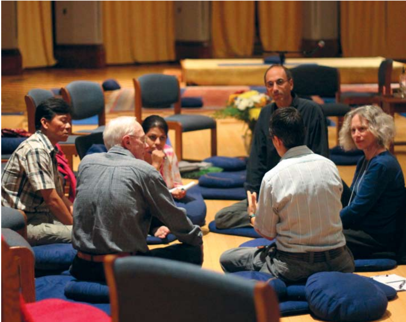
After a 36-hour period of silence, participants gathered into small groups to discuss the relationship of contemplative practice to teaching, learning and knowing at the 2012 Retreat for Educators.