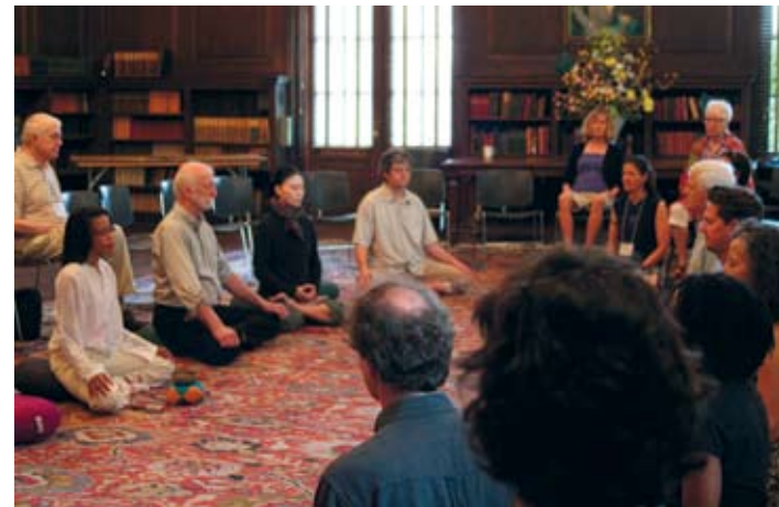
Above: a morning meditation session at the 2012 Summer Session on Contemplative Pedagogy at Smith College.